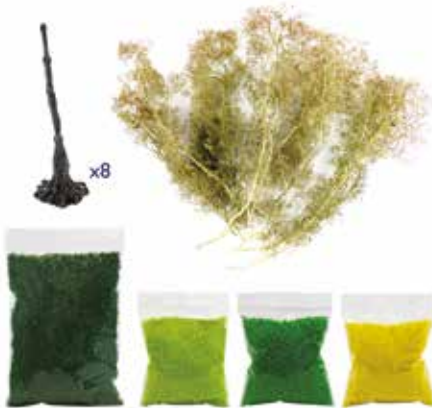
WSLF060 Summer Realistic Tree Making Kit Summer Kit includes Dark Green Coarse, Algae Fine, Mid Green, and Yellow Fine Foliage