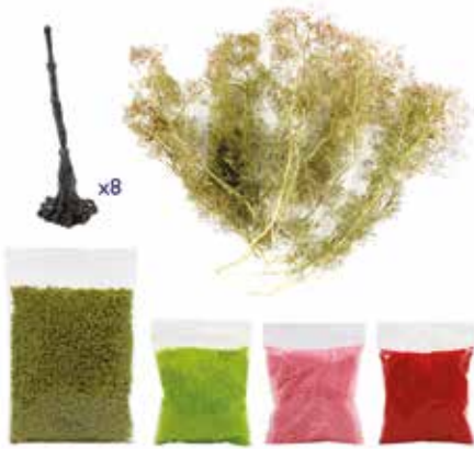
WSLF059 Spring Realistic Tree Making Kit Spring Kit includes Olive Green Coarse, Algae Fine, Pink Fine, and Red Fine Foliage

Each kit contains 8 Resin Tree Trunks. Seafoam and a selection of foliage. Using the tree trunks and branches, glue together to create your own unique tree