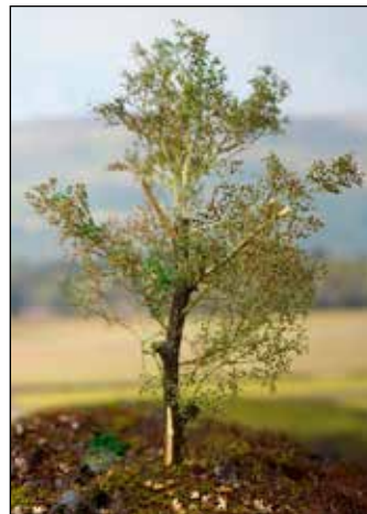
WSTR024 Seafoam Trees Box - Mixed Sizes Summer Kit includes Dark Green Coarse, Algae Fine, Mid Green, and Yellow Fine Foliage