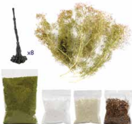
WSLF063 Winter Realistic Tree Making Kit Winter Kit includes Burnt Grass Coarse and White Fine Foliage, Forest Ground Cover, and 0.5mm Snow Scatter