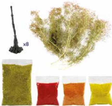
WSLF061 Autumn Realistic Tree Making Kit Autumn Kit includes Mixed Seasonal Green, Orange Fine, Yellow Fine, and Red Fine Foliage